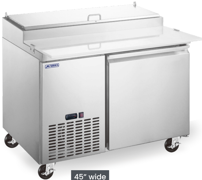
45" wide 59042