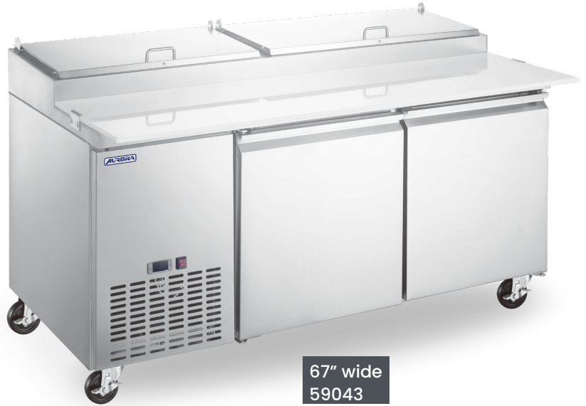
67" wide 59043